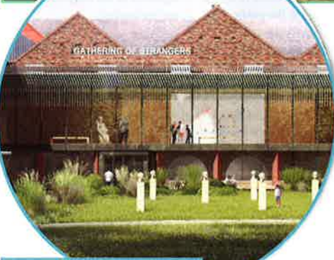
Whitworth Art Gallery