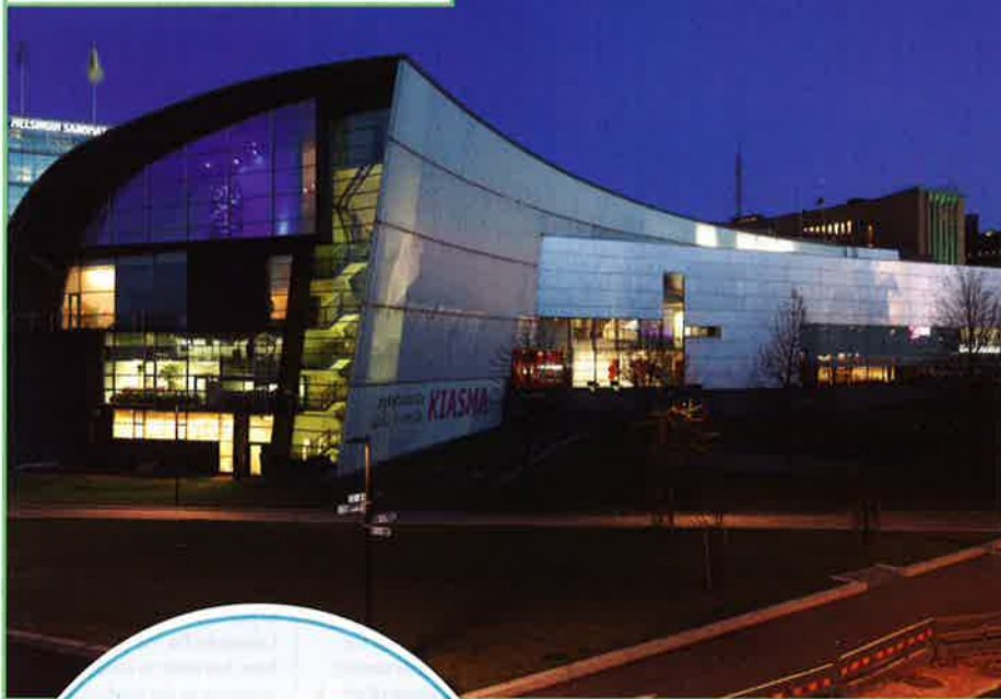
Kiasma Museum of Contemporary Art