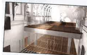
York Art Gallery

► York Art Gallery's £28m redevelopment, which includes a mezzanine gallery (below) for the ceramics collection, is due to be unveiled in the summer. G.H.